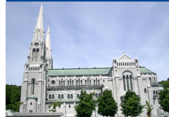
St. Anne De Beaupre Shrine

Departure: Negaunee Senior Center, 410 Jackson St, Negaunee, MI @ 8 am