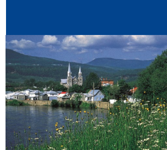
The beautiful Charlevoix Region of Québec.