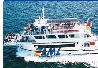
Whale Watching Cruise on Bay St. Catherine.